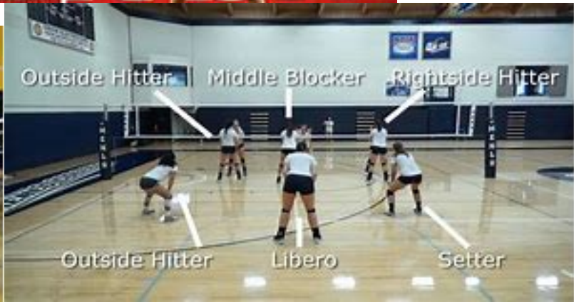
Sequence of shots: Dig - Set - Spike