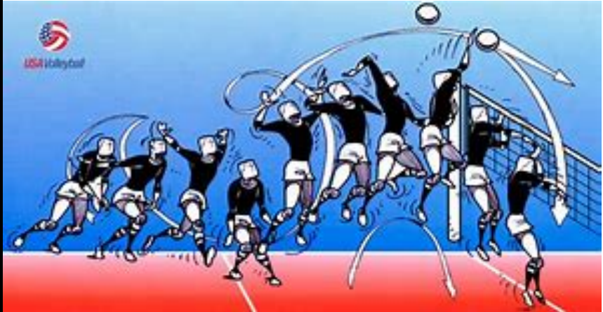
Spike (attacking) shot